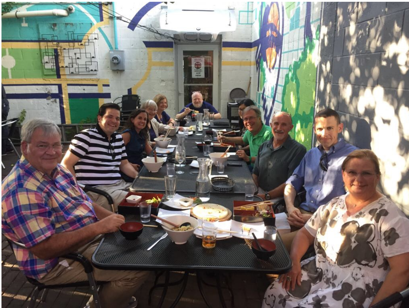
FOODIES! at Obento-Ya in July