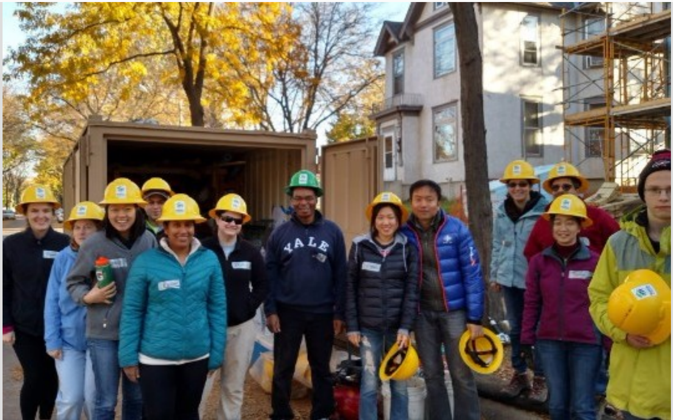
YAANW volunteering with Habitat for Humanity in October 2016