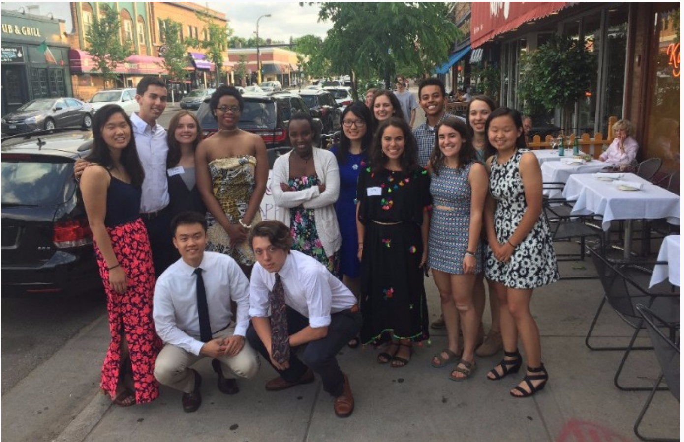
2017 Bulldogs on the Lakes Interns

We can't thank enough the alums who host and help arrange events and opportunities for the interns.