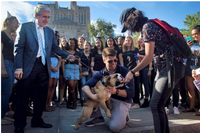
Handsome Dan XVIII's first birthday