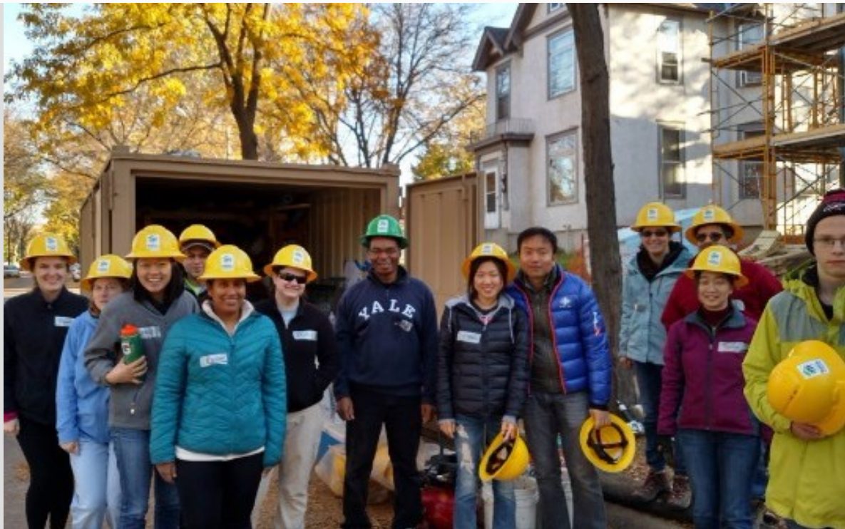
YAANW volunteering with Habitat for Humanity in October 2016